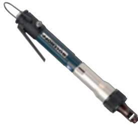
Complete installation tool with pre-stressing cartridge M 2,5 up to M 10