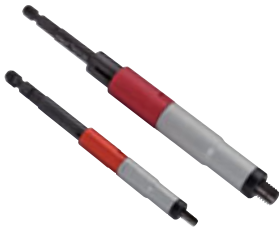
Complete installation tool M 2,5 up to M 12