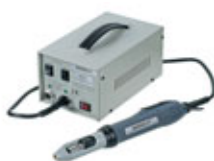
Type E-S 206 M 6 / UNC 12-24 / UNF 10-32 (without picture: Type E-S 410 for larger dimensions)