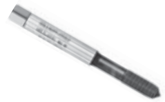
Machine tap former