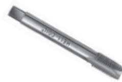
Machine tapping tools