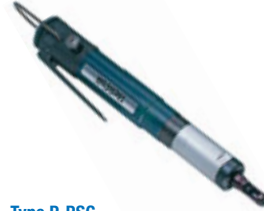
Type P-PSG up to M 26 / UNC 1/2"-13 / UNF 1/2"-20