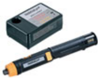
Type B-S 206 up to M 6 / UNC 1/4"-20 / UNF 1/4"-28 (without picture: Type B-S 824 for larger dimensions)