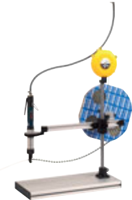
Parallel system type S for installation of stripfeed inserts