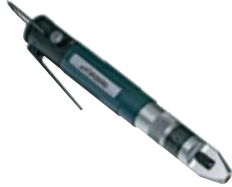
Type P-S 1216 for larger dimensions