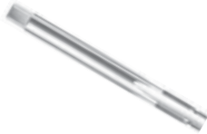
Drill and tapping tools